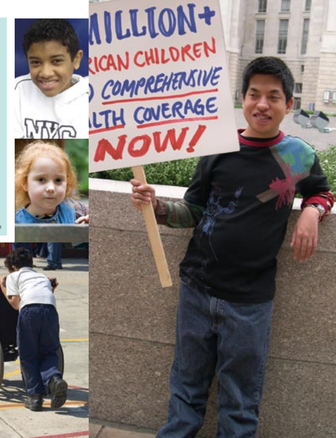
continued from page 5