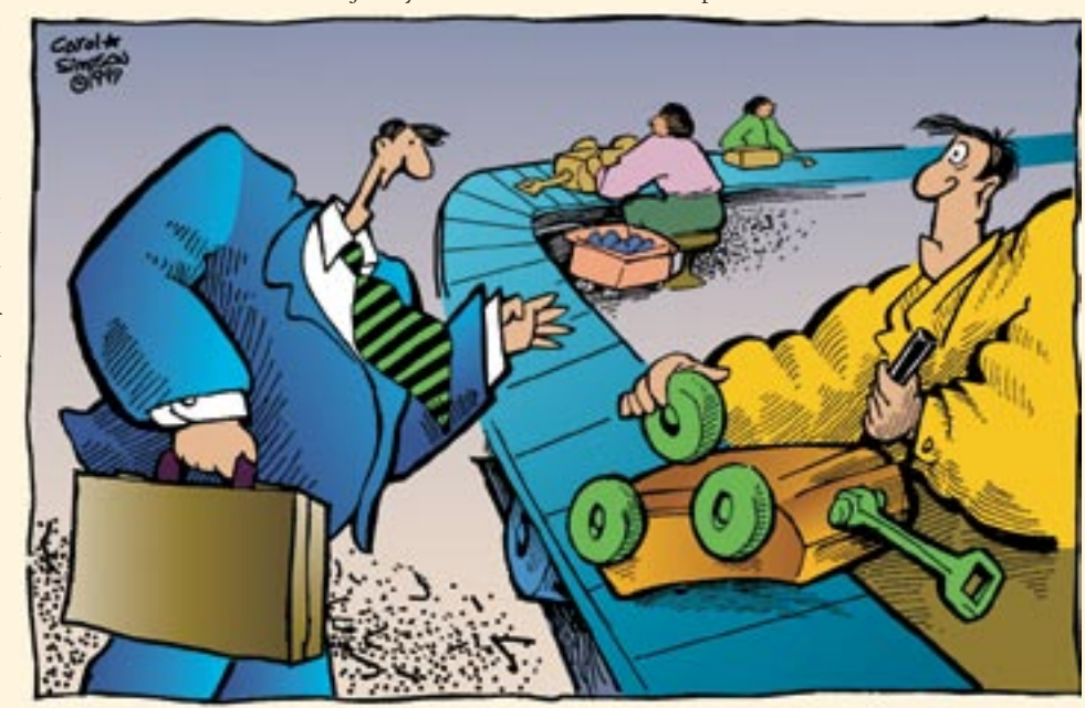
"You've got to learn not to sweat the small stuff... like your salary."

Work on the FY 2008 budget commenced with the presentation of the President's budget request on February 5th. It is now the task of the appropriations and authorizing committees to determine the levels at which programs under their jurisdiction will be funded. This is an important time for NET-WORK members to be in contact with their Members of Congress to advocate for the needs of those with the least economic power.