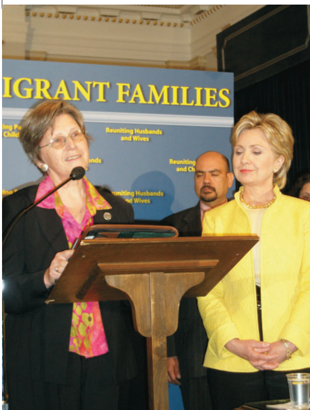
NETWORK Executive Director Simone Campbell, SSS, speaks in support of immigrant families at May 23rd Capitol Hill press conference. Senator Hillary Clinton (D-NY) was a sponsor of bipartisan legislation designed to help immigrants reunite with family members.

without debate. This denies the electorate a voice in influencing trade negotiations through their elected representatives. The Democratic majority must overcome their differences in order to develop a more just and balanced international trade policy, one that will protect and enhance the livelihoods of millions of our citizens and those of the developing world living on the economic edge.