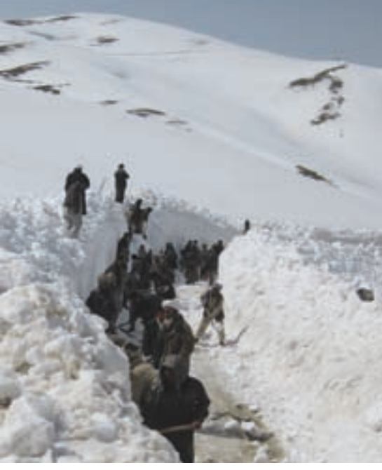
Snow-clearing is among the CRS cash-for-work projects. Greenhouses increase the growing season by several months—critical to families' subsistence and income generation.

Participatory community assessments highlighted the most vulnerable com-