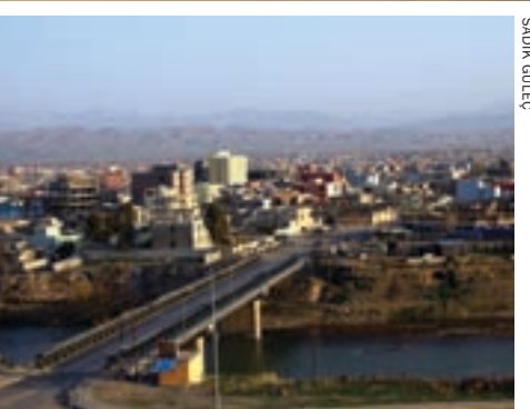
Clockwise from top: Laborers in Badakhshan, Afghanistan; Zakho City in Kurdistan, Iraq; a Ierusalem street.

In the 2009 encyclical Charity in Truth, Pope Benedict highlights that development calls for a multidisciplinary approach that embraces the economic, social and political realities. The Pope underscores that all humanity has a RIGHT to food, clean water and meaningful work. He goes on to point out that both governments and people who control the markets are morally required to prioritize these needs. Therefore it is up to both governments AND corporations to respond to the needs of those with the least in our world. To embody this teaching at the governmental level, U.S. foreign assistance must be reformed.