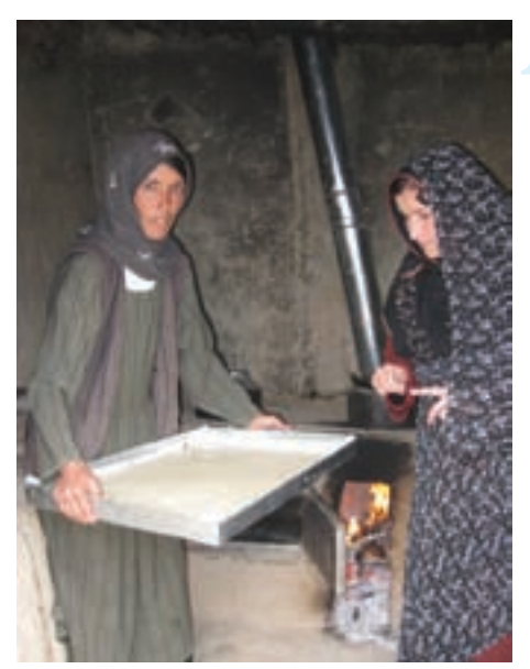
The team leader from the Ghor Province Self Help Group puts a cake in the oven, assisted by the CRS Field Officer.

Afghanistan is one of the poorest, least developed countries in the world, ranking 155 out of 169 in the 2010 UN Human Development Index. But there are many success stories in Afghanistan and ample opportunities to reduce poverty. In 2011, more Afghans have access to schools and health services than ever before. In some villages, migrants who left to work in low-paid, dangerous jobs in neighboring countries are now returning, thanks to improved opportunities.