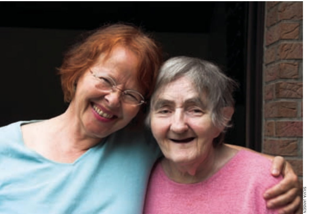
A social worker hugs a woman with Alzheimer's.

It is these core issues of fairness, equity and support for working families that should define our legislative strategy for 2012 and beyond.