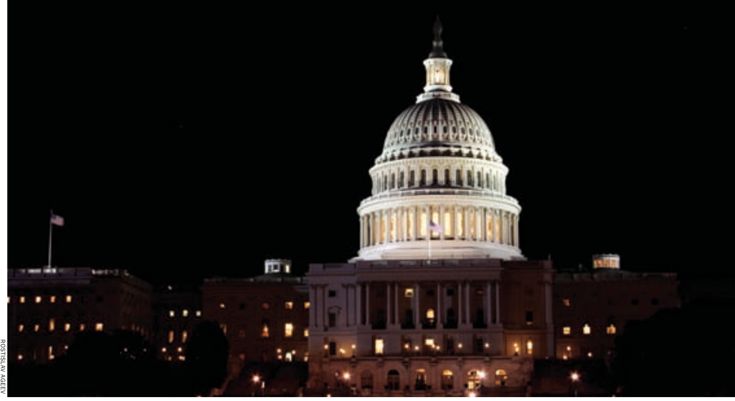
The lit beacon in the Capitol dome's cupola indicates Congress is in session.