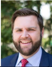
J.D. Vance Republican jdvance.com