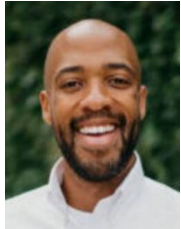
Mandela Barnes Democrat mandelabarnes.com

We invite you to consider this information prayerfully.