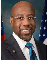
Raphael Warnock Democrat Incumbent warnockforgeorgia.com

Here is where the Georgia Senate candidates stand on the issues. We invite you to consider this information prayerfully.