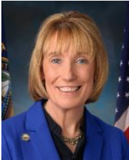
Maggie Hassan Democrat Incumbent maggiehassan.com

Here is where the New Hampshire Senate candidates stand on the issues. We invite you to consider this information prayerfully.