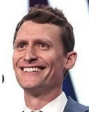
Blake Masters Republican blakemasters.com