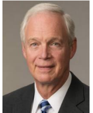
Ron Johnson Republican Incumbent ronjohnsonforsenate.com