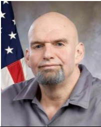
John Fetterman Democrat johnfetterman.com

Here is where the Pennsylvania Senate candidates stand on the issues. We invite you to consider this information prayerfully.