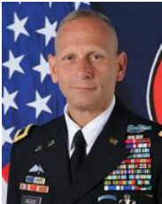
Donald Bolduc Republican donbolduc.com