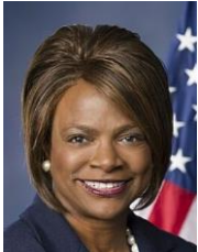
Val Demings Democrat valdemings.com

We invite you to consider this information prayerfully.