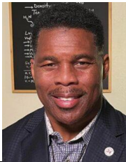
Herschel Walker Republican teamherschel.com