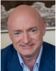
Mark Kelly Democrat Incumbent markkelly.com

We invite you to consider this information prayerfully.