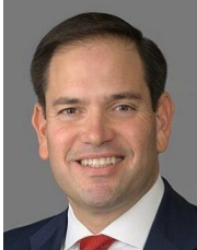
Marco Rubio Republican Incumbent marcorubio.com