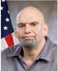
John Fetterman Democrat johnfetterman.com

We invite you to consider this information prayerfully.